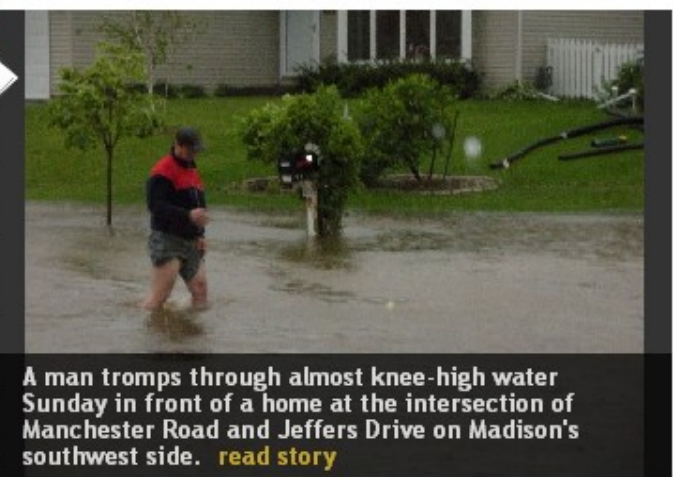
A man tromps through almost knee-high water Sunday in front of a home at the intersection of Manchester Road and Jeffers Drive on Madison's southwest side. read story