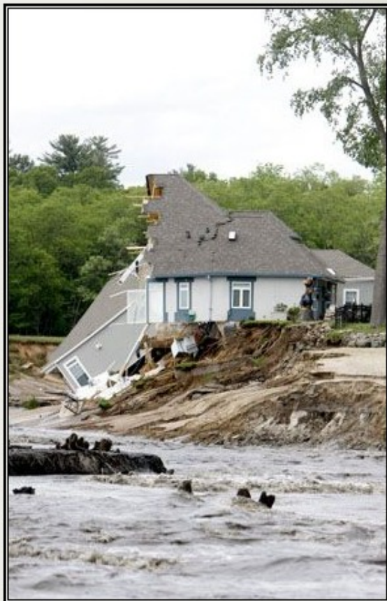
Photo gallery of Lake Delton